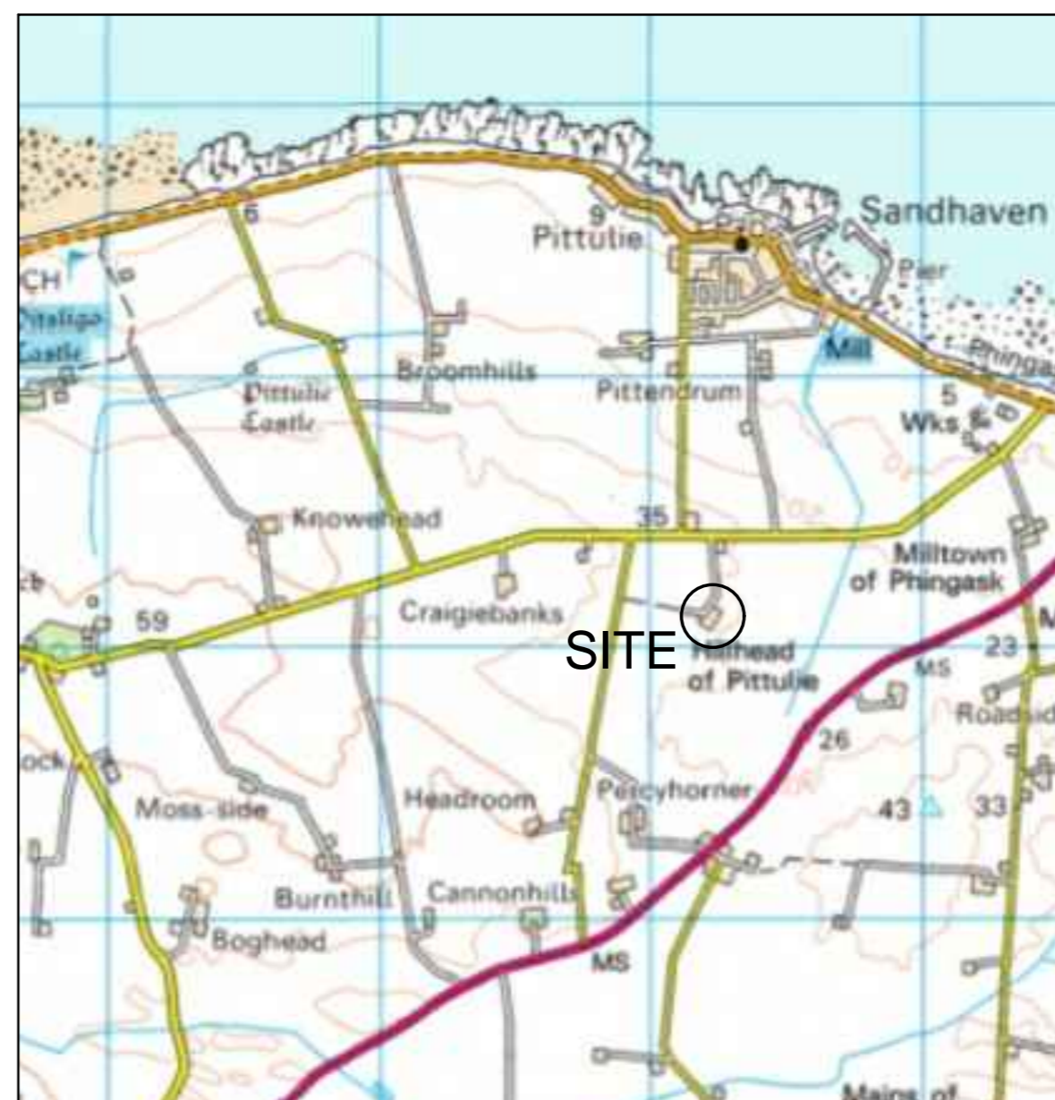
Location Plan : Scale 1 : 25000