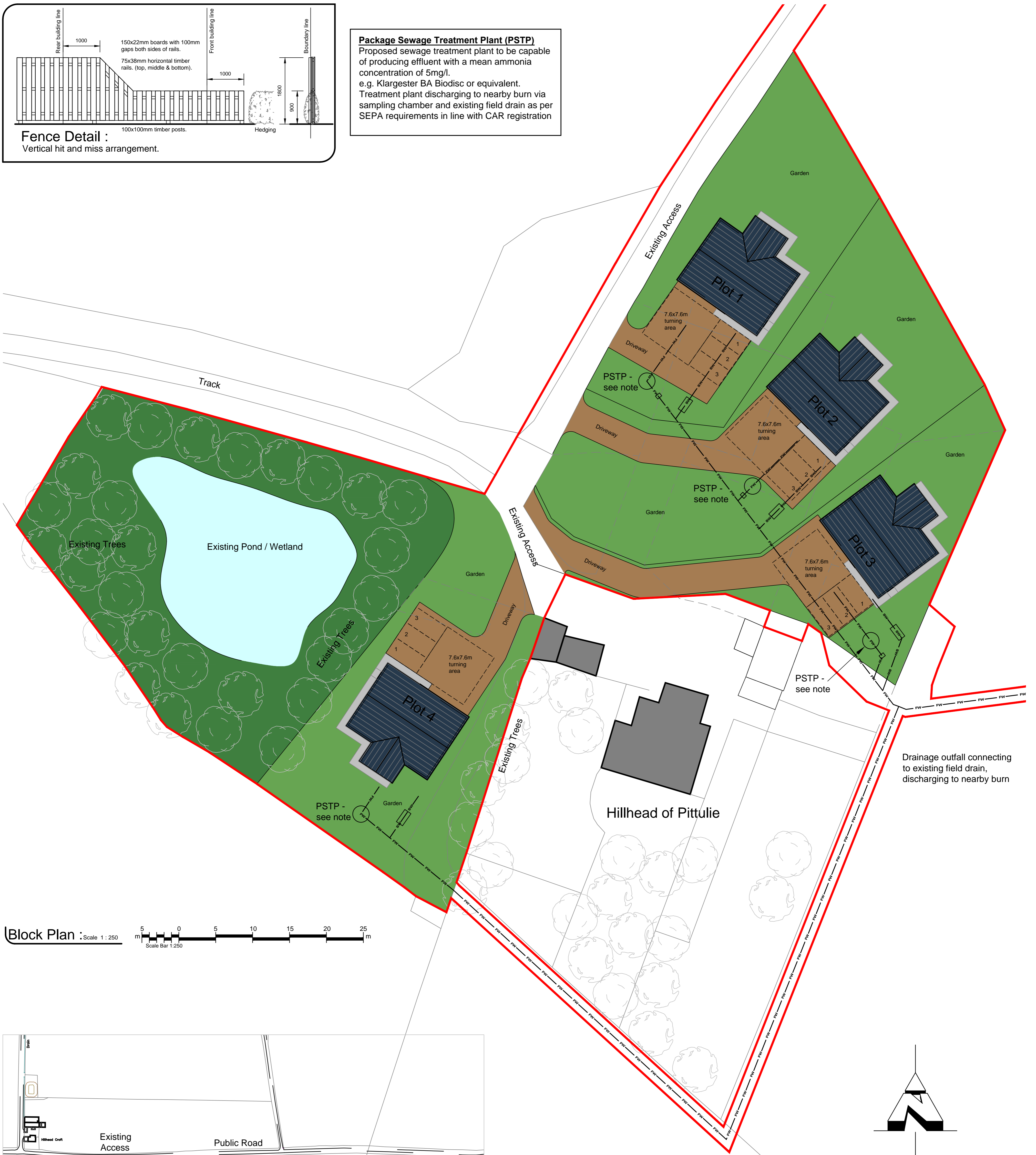
Block Plan : Scale 1 : 250 Scale Bar 1:250

Package Sewage Treatment Plant (PSTP) Proposed sewage treatment plant to be capable of producing effluent with a mean ammonia concentration of 5mg/l. e.g. Klargester BA Biodisc or equivalent. Treatment plant discharging to nearby burn via sampling chamber and existing field drain as per SEPA requirements in line with CAR registration